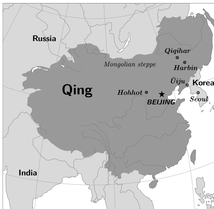
Map of the Qing dynasty (circa 1760)

△ Manchu belongs to the Tungusic family. It was spoken by the Manchu tribes in the historical region of Manchuria in Northeast Asia. It was one of the official languages of the Qing empire, which was founded by the Manchus. With the passing of time, Manchu has been gradually replaced by Chinese, leaving only a few dozen native speakers in the current days.